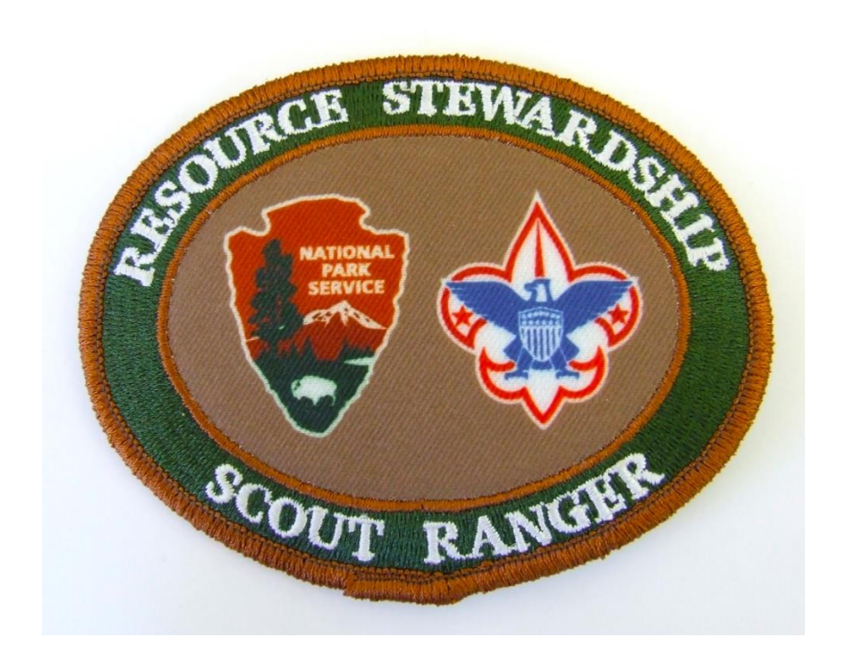
Scout Ranger Badge