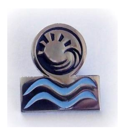
Blackstone Valley 101 Lapel Pin