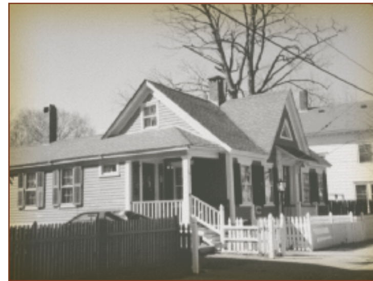
"Because of its ethnic diversity, Central Falls is an exciting place to be."

Turn right onto Dexter Street. Turn right onto Hunt Street then right onto High Street. Continue on High Street to Pierce Park which is on the left side.