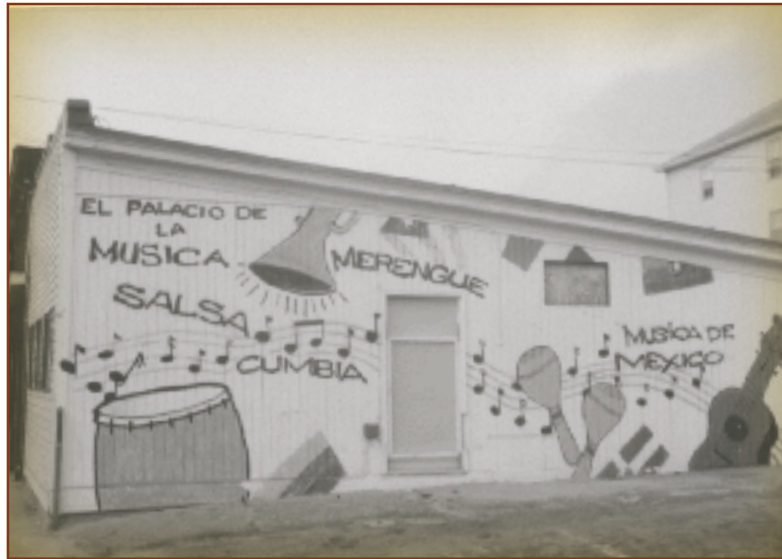
Above: El Palacio De La Musica Mural: Dexter Street.