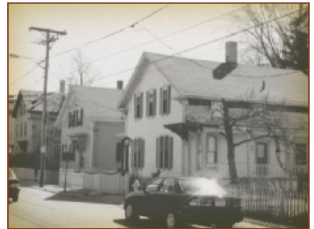
These tidy Greek-Revival houses from the 1840s are just one example of the mill worker housing that still exists in the South Central Falls Historic District.

"Using the best of all ethnic groups — that's what Central Falls is all about."