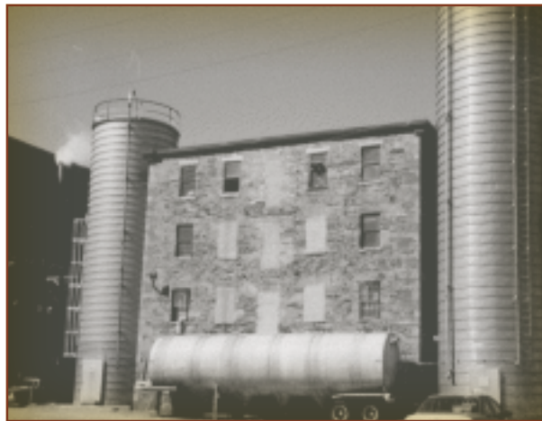
Pawtucket Thread Company (1825) Four story stone mill now hidden by the massive brick mills that surround it.

From Roosevelt Avenue turn left at light onto Charles Street. Proceed west four blocks, following one way signs, to the intersection with Broad Street. Turn left, Jenks Park and City Hall are one block down on the right.