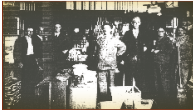
Crossroads inevitably create commerce, and by 1813, there were 13 dry goods and grocery stores in Chepachet village. The goods for sale today at Brown and Hopkins Country Store (operating under this name since 1929) are stacked on shelves and counters that have endured nearly 200 years of practical use.

Downstream, the Chepachet weds the Clear River, forming the Branch River. It joins the Blackstone River which eventually empties into the sea.