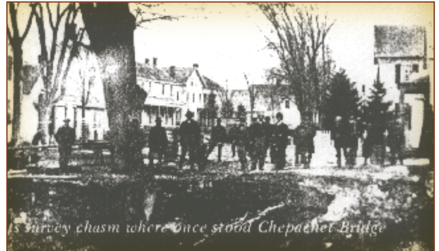
The freshet of February 1867 washed away the entire bridge and deeply gouged the riverbed and the embankments below where these people are standing. Climbing down and up the muddy slopes, everyone crossed the river by boat until a makeshift bridge was built over the falls.

At the end of Oil Mill Lane, turn left onto the main street. As you cross the bridge, look closely at the two different kinds of stonework on the corner of the stone mill. You will notice a massive repair. In February of 1867, the Chepachet River swelled from torrential rains and meltwater. When dams upriver began to break, a flash flood washed away many structures entirely, including the gristmill where Betty's snipers hid. It nearly destroyed the mill. The oldest part of this stone building was the Chepachet Manufacturing Company, a cotton and later woolen mill. Before the flood, it had three floors, but it was rebuilt with one less story. One of the village's first textile mills, it is now the last left standing. Later, wooden additions were demolished, but not cleared off the site.