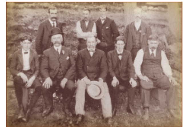
Nipmuc Park employees around the turn of the century.