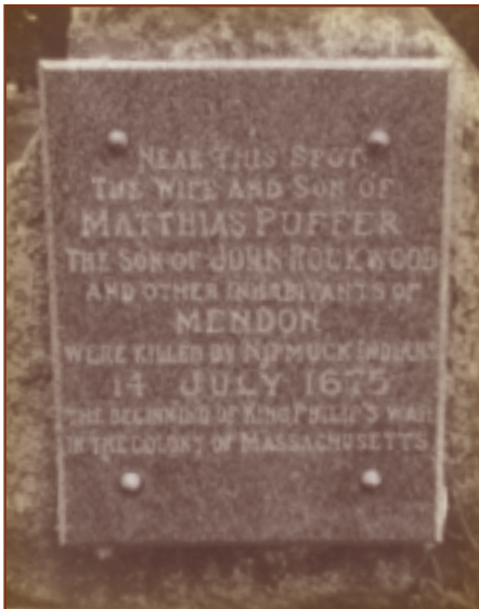
This plaque on Providence Street at the intersection of East Hartford Avenue, marks the beginning of King Philip's War in the Massachusetts Bay Colony.

Legend has it that President Washington, during his triumphal inaugural journey in 1789, had planned to stay at the tavern upon his return trip to New York. But the innkeeper's wife did not recognize the presidential party and advised them to continue down the road to the Taft Tavern in Uxbridge. There is no known account of how the president reacted to this unexpected refusal, but an existing letter from Washington reveals that he was greatly pleased by the hospitality he received from the Tafts, ancestors of future president William H. Taft.