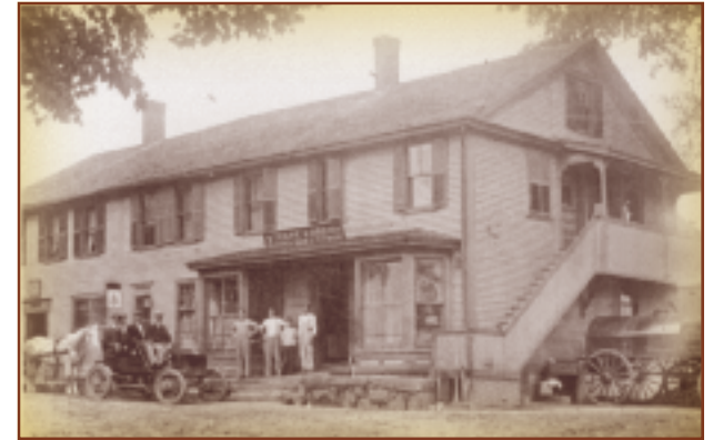
This 1830s commercial block once housed the town's post office.

Many people enjoy an afternoon in the Old Cemetery because of its interesting art and epitaphs such as this one: My children dear, this place draw near, a mother's grave to see. Not long ago I was with you, and soon you'll be with me.