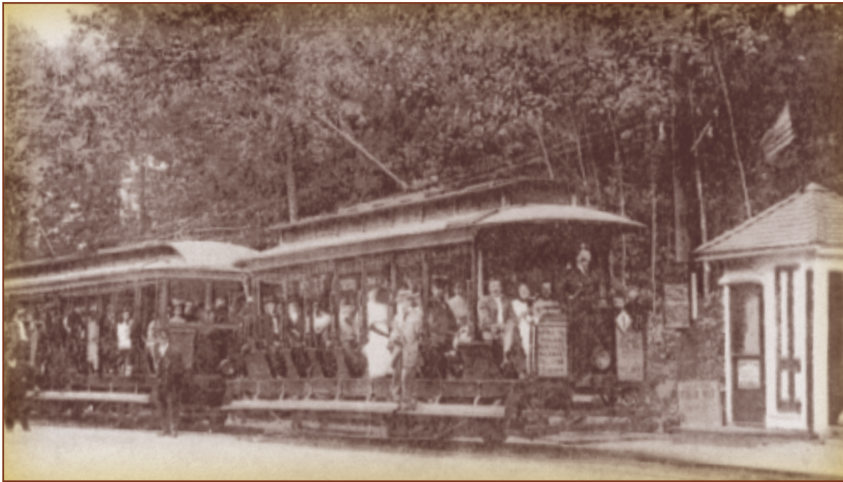
Lake Nipmuc Park was a popular resort for many years. Its theater drew top-notch vaudeville acts and its ballroom attracted the best in the musical world. Transportation to the park was originally by trolley from Milford and from Uxbridge. On weekends, the cars ran about every 15 minutes.

Turn back along Maple Street and return to Main Street, noting the modest 19th century houses that form the nucleus of the town. Holding pride of place in the town center is Memorial Square — dedicated to Mendon's sons and daughters who served their country in times of war.