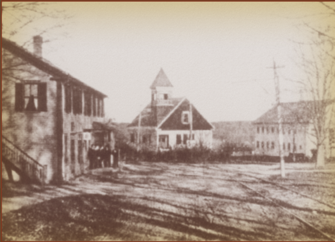
Known by many as the "Mother Town," Mendon gave birth to communities destined to become giants in the Industrial Revolution: Uxbridge, Northbridge, Milford, Blackstone, Hopedale, Millville, and parts of Upton and Bellingham.