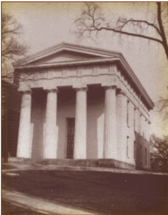
The Rhode Island Historical Society

This Greek revival style building originally housed a library downstairs and a chapel upstairs. Used commercially to the extent that the style eventually was ridiculed by taste makers in the mid-1800s, today the best of the Greek revival buildings are among the most powerful designs on the landscape. Stand next to one of the Doric columns in the deep shadow underneath the portico of Manning Hall. You feel the permanence and strength of the forms.