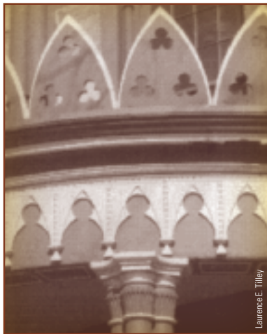
Laurence E. Tilley

from detailed drawing in James Gibbs' "Book of Architecture," published in England in 1728. As much a landmark 200 years ago as it is today, the religious symbolism of the 185 foot steeple is sometimes secondary to its usefulness as a navigational aid by sea or by land.