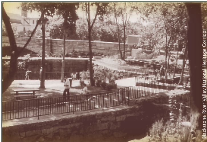
Blackstone River Valley National Heritage Corridor