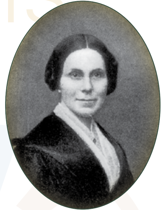
Elizabeth Buffum Chace was one of Rhode Island's leading reformers during the 19th century. Her earliest activities were in the abolitionist movement, inspired by her strict Quaker beliefs. Later she became active in campaigns for women's suffrage and temperance and also played a key role in reforming the state's prison system.

The Valley Falls Company Mills shut down in the 1930s, ending an important phase in the history of both the village and the town of Cumberland. Despite this loss, Valley Falls continues to be the urban center of Cumberland. So while the site of the old mill has been turned into a park, the thriving business along Broad Street and the presence of the active Portuguese community here provide a taste of what Valley Falls was like during the textile boom years.