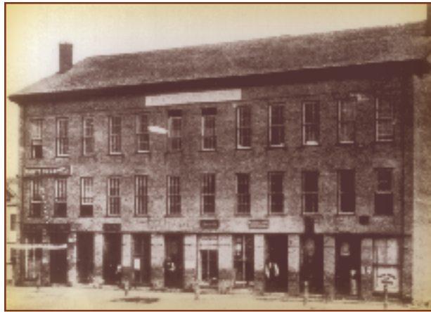
Blackstone Block (c. 1900)