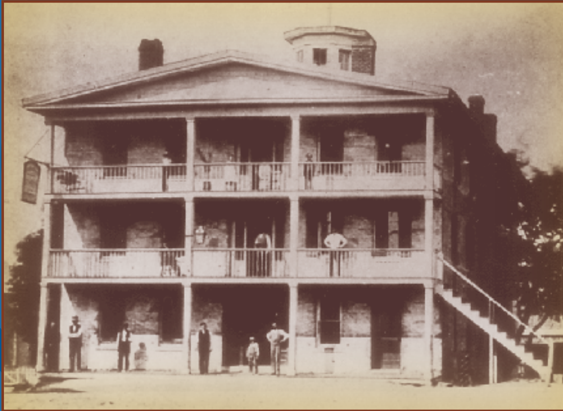
Union Hotel (c. 1900).