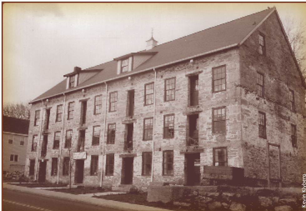
The Arcade (1843) - This granite store block was the first shopping center in Blackstone Village.

Along Church Street are several mill houses built by the Blackstone Manufacturing Company. #6 was built c.1840, but the seven duplexes between # 10 and # 25 were built c. 1820. At the corner of Church Street and Main Street is the Arcade. Made of granite and rubble stone, the Arcade was built by the B.M.C. in 1843 to house the company store. A large room on the upper floor, known as Arcade Hall, was used as a social hall and community center. It was also the first shopping center in Blackstone Village. The Arcade has been recently restored and reopened as a church.