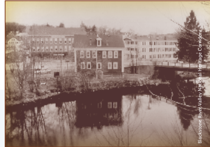
During the 1850s, Monument Square became the commercial center for Waterford. In the foreground is the McMullen Block. To the left is the brick Blackstone Block and to the right is the Union Hotel.

Today, the mills and the rail station are gone, but Blackstone continues to act as a junction between Massachusetts and Rhode Island. Many residents of Blackstone work in Woonsocket, as has been the case for over a century. The most recent example of bi-state cooperation was the creation of Blackstone Gorge State Park in 1991. The park is jointly maintained by Rhode Island and Massachusetts, and is one of the best examples of the cooperation which has been integral to the success of the Blackstone River Valley National Heritage Corridor.