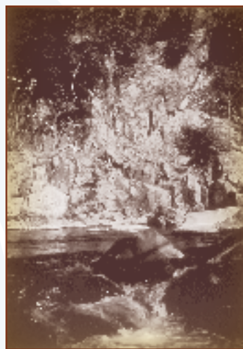
The rock cliffs of the Blackstone Gorge as seen from the water below.