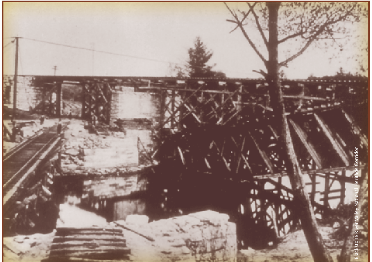
Blackstone River Valley National Heritage Corridor

A number of railroad bridges have been built and demolished over the years in Blackstone. At one time, all of the rail and street bridges in town were wooden, but these have long since been replaced by stone or steel bridges.