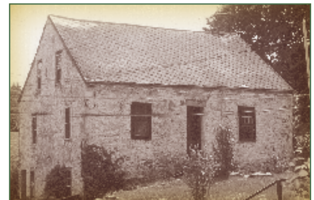
Although this was mill-owned housing, workers did not live here free. The bookkeeper of the mill in 1852 tallied that these and other worker tenements in Georgiaville, 41 units in all, netted the corporation $917 in rent that year.