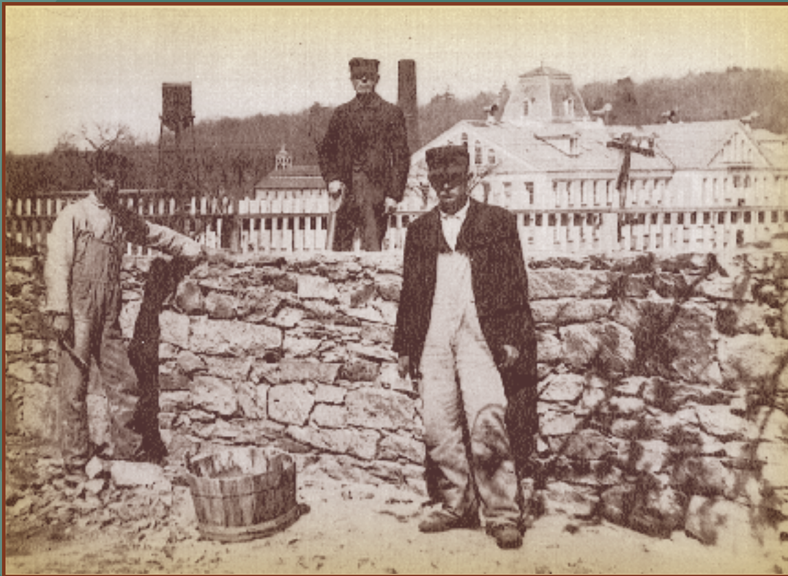
Stonemasons and Georgiaville Mill