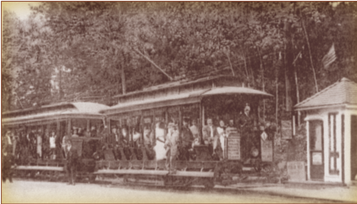
Lake Nipmuc Park was a popular resort for many years. Its theater drew top-notch vaudeville acts and its ballroom attracted the best in the musical world. Transportation to the park was originally by trolley from Milford and from Uxbridge. On weekends, the cars ran about every 15 minutes.

Turn back along Maple Street and return to Main Street, noting the modest 19th century houses that form the nucleus of the town. Holding pride of place in the town center is Memorial Square — dedicated to Mendon's sons and daughters who served their country in times of war.