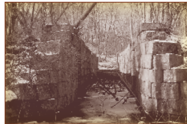
Clues to Millville's past are all around us – this short "above-ground" archaeological expedition shows you what to look for. Along almost every swift-moving waterway in New England, evidence of early industry has been found—the Blackstone River through Millville is no exception.

Today, the families who live along Millville's quiet side streets and miles of winding country roads enjoy the secure residential lifestyle of their community. No one doubts Millville will always maintain the one feature it has cherished since the day of the great parade in 1916—its own identity.