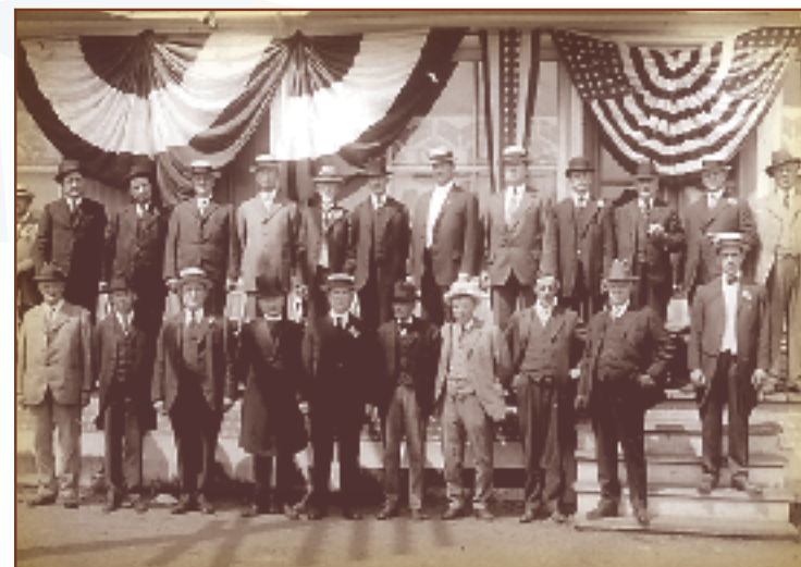
Millville's Separation Committee on May 31, 1916. Notice the different suit styles. Only one gentleman chose not to don a hat that day on the parade reviewing stand.